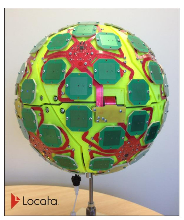
Locata VRAY Orb-80 Antenna: The first commercial VRAY antenna, designed to mitigate multipath for difficult machine automation applications in warehousing, supply-chain, port and industrial environments. This design will be modified by AFIT for use with GPS receivers.